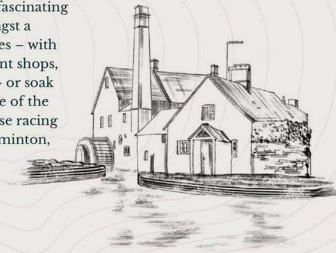
The Old Mill, Lower Slaughter

Famous for its quintessential market towns and honey-coloured cottages, the rolling Cotswolds are bursting with character and charm. Here you'll find a whole host of award-winning hotels, pubs and world-class restaurants as well as many other fascinating places to visit. Lose yourself amongst a constellation of picturesque villages – with a variety of quirky and independent shops, restaurants and farmers markets – or soak up the amazing atmosphere of one of the many sporting events, such as horse racing at Cheltenham or eventing at Badminton, to name just two.